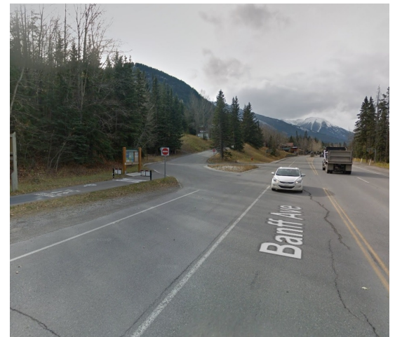
Site of the future greenway on Banff Avenue

Enhancements to the park’s entrances and traffic calming measures will also be supported as part of this project.